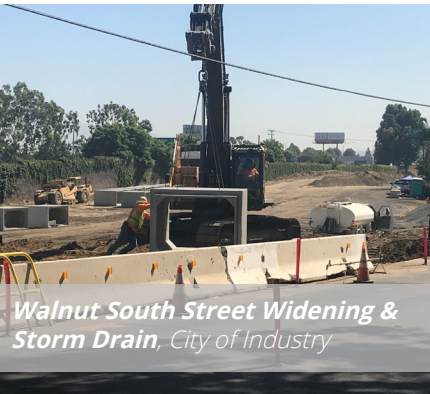
Walnut South Street Widening & Storm Drain, City of Industry