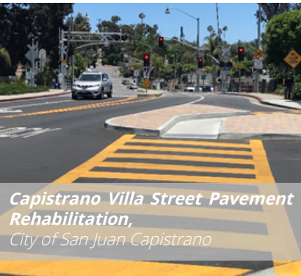
Capistrano Villa Street Pavement Rehabilitation, City of San Juan Capistrano