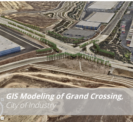
GIS Modeling of Grand Crossing, City of Industry