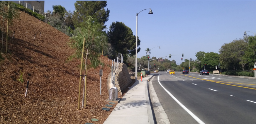
Del Obispo Street Widening, City of San Juan Capistrano

CNC Engineering delivers high quality professional services for a variety of challenging and high-profile capital improvement projects all throughout Southern California.