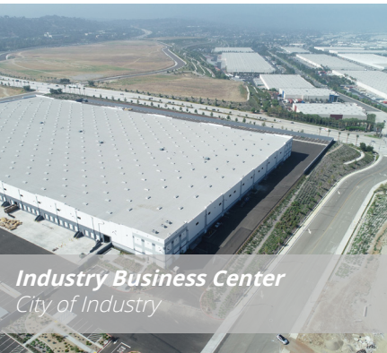
Industry Business Center, City of Industry